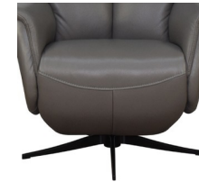
BLACK PRONG BASE