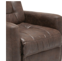
AVAILABLE IN 2 SEAT WIDTHS