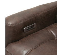
POWER BUTTON WITH USB CHARGER